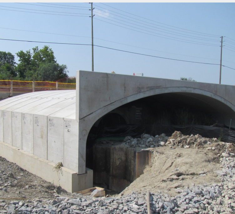
The first nine sections of a precast arch culvert were completed on Thursday, July 25.