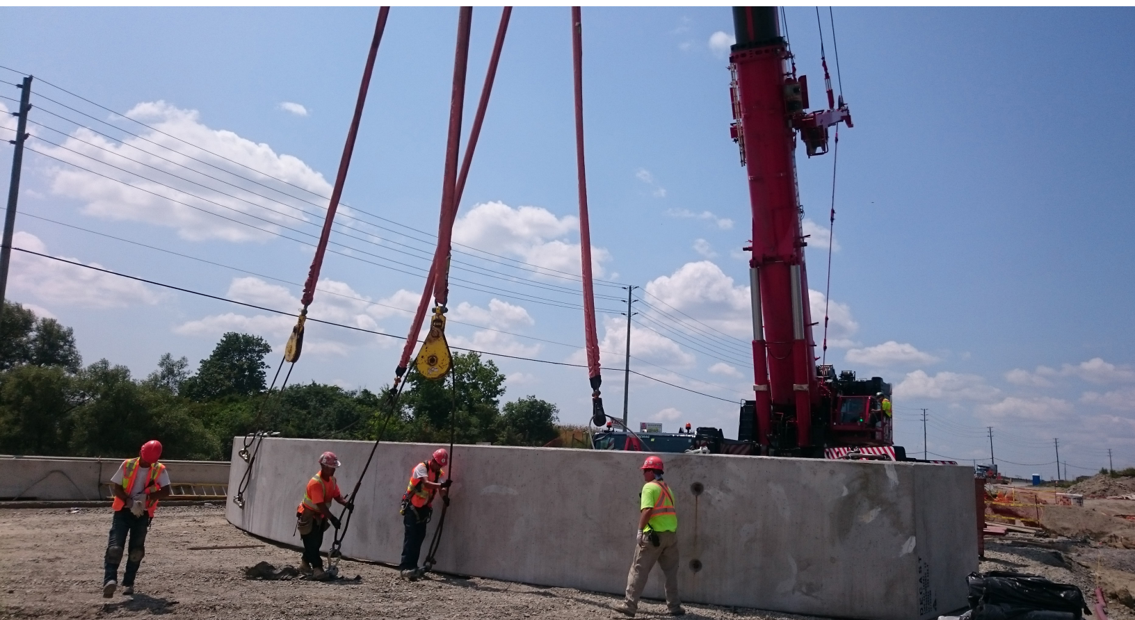
View of one of the nine culvert sections, pre-lift during installation on Thursday, July 25.

The majority of the Langstaff crossing will be built offline to avoid impacts to the existing travel lanes. Therefore, minimal traffic impacts are anticipated.