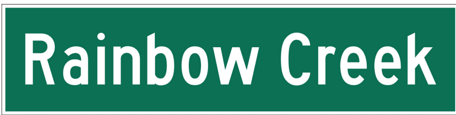
Example of a Natural Feature Guide and Information Sign you may see on the Highway 427 Expansion. For illustrative purposes only.

On the Highway 427 Expansion, you will see green signs to guide you, such as announcing an upcoming exit for Rutherford Road. Other green signs will be at locations along the highway to inform you that you are passing over Rainbow Creek or under Zenway Boulevard, for example. You will also see small white "shield" signs after each interchange indicating you that you are on Highway 427 northbound or Highway 427 southbound.