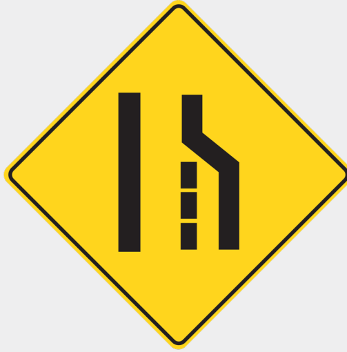
Example of a Lane Ends Warning Sign you may see on the Highway 427 Expansion. For illustrative purposes only.

On the Highway 427 Expansion, for example, you will see Warning Signs advising of the speed at which you can safely drive along an exit ramp, others advising you that a lane is exit-only, and some telling you that your lane is ending and you should merge left.