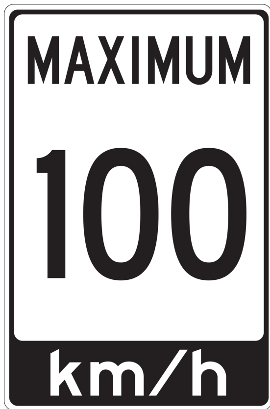
Example of a Maximum Speed Limit Regulatory Sign you may see on the Highway 427 Expansion. For illustrative purposes only.